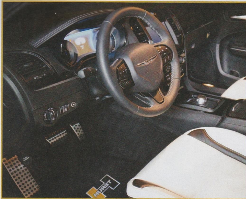
Interior accents include Hellcat brushed aluminum pedal pads and dead pedal, Chrysler 300-H bright door sill accents, Hurst logo plush carpet mats and a unique serial number dash plaque that identifies this car as one that is truly special.

Unlike the golden days of the original muscle cars back in the 1960s, today performance cars are expected to handle as well as they accelerate, and the