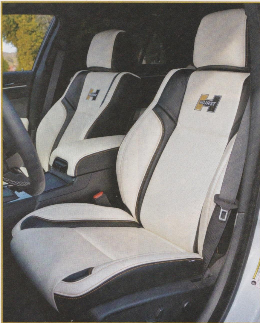
Inside, the Chrysler 300-H mirrors the exterior with its Katzkin custom Pearl White Tuscany glove soft leather that features the legendary Hurst logo embroidered in the seat backs.

Chrysler 300-H doesn't disappoint. Armed with 20 x 9 and 20 x 10 inch Hurst Stunner wheels at all four corners that are shod with 275/40ZR20 and 315/35ZR20 Nitto NT555 G2 directional tires, this combination of rolling