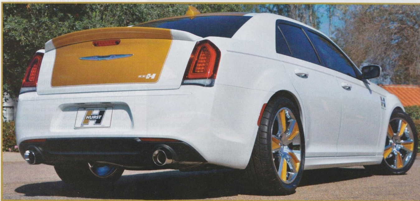
Complementing the intake is a Flowmaster American Thunder cat back dual exhaust system that's capped off with large 4-inch diameter Hurst logo exhaust tips that accent a Euro spec Chrysler 300 SRT rear diffuser.

Over the years, the Chrysler 300 has evolved through numerous changes, reflecting design trends and changes in consumer taste. Today, the Chrysler 300C is a thoroughly modern automobile that is as contemporary as any of its