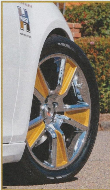
20 x 9 and 20 x 10 inch Hurst Stunner wheels at all four corners that are shod with 275/40ZR20 and 315/35ZR20 Nitto NT555 G2 directional tires, this combination of rolling stock works in perfect harmony with the Hurst Stage 1 lowering springs.

Fast forward to 1970, a time when longer, lower and wider cars dominated the landscape, and Chrysler, with its Fuselage styling, was at the height of its