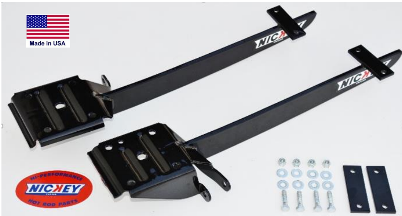
1967 Style Nickey® Camaro Traction Bars Shown

ORIGINAL NICKEY® TRACTION BARS FOR 1967 – 1969 CAMARO'S NICKEY® CAMARO TRACTION BARS ARE ONLY $ 495.00 PLUS SHIPPING.