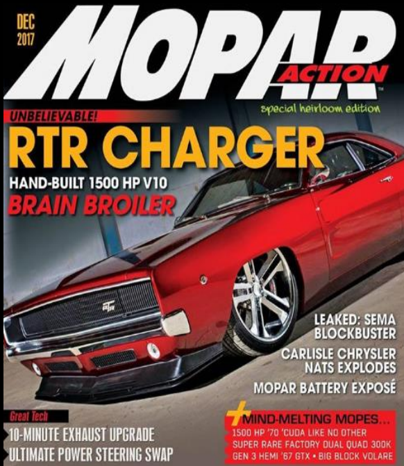
As seen in Mopar Action Magazine December, 2017