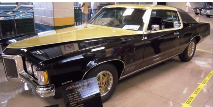
1970 HURST GRAND PRIX SSJ