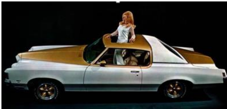
1971 HURST GRAND PRIX SSJ