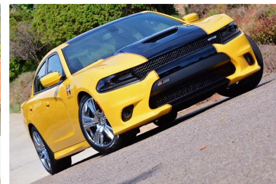
2017 HURST HERITAGE BY GSS CHARGER