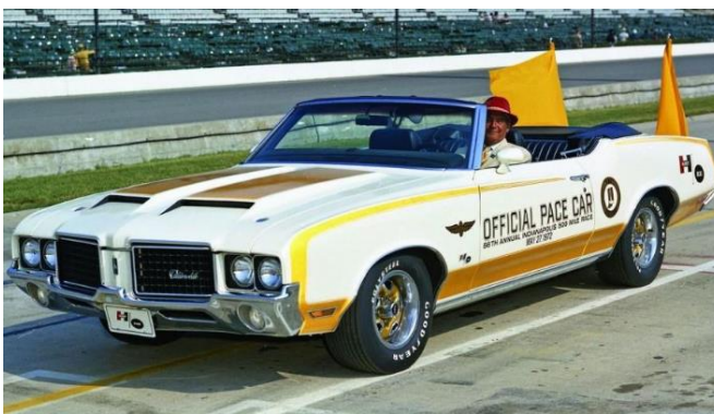
1972 HURST OLD 442