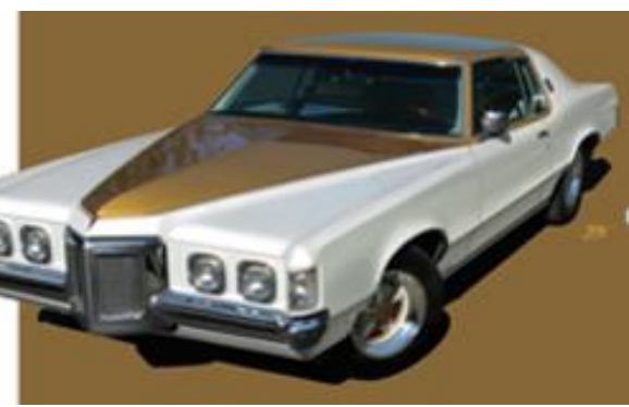
1969 HURST GRAND PRIX