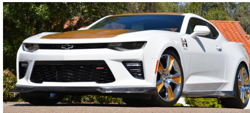
2017 HURST HERITAGE BY GSS RPO CAMARO