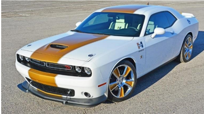
2015 HURST HERITAGE BY GSS CHALLENGER