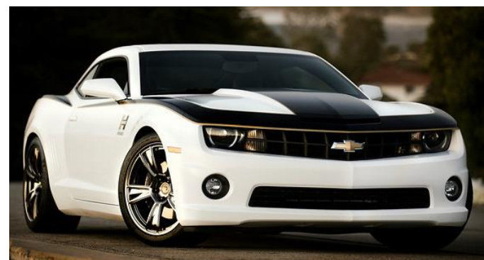
2010 HURST PERFORMANCE CAMARO