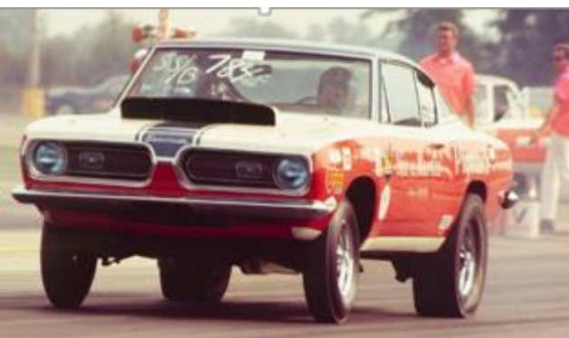
1968 HURST HEMI CUDA