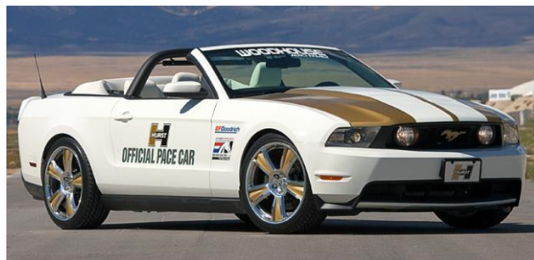
2009 HURST PERFORMANCE VEHICLES MUSTANG