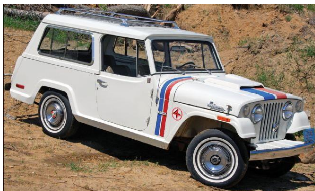
1971 HURST JEEPSTER COMMANDO