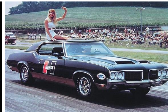
1971 HURST OLDS 442