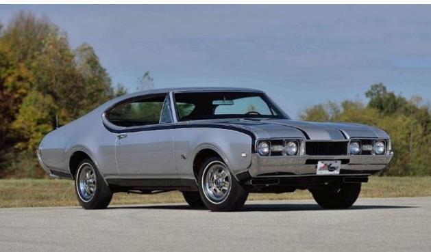
1968 HURST OLDS 442