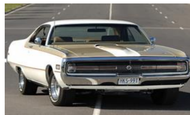
1970 HURST CHRYSLER 300H

Note: The photos shown were sourced on Google Images. We do not own the rights to any of the images with the exception of those of the Hurst Heritage By GSS models.