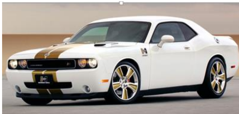
2008 HURST PERFORMANCE VEHICLES CHALLENGER