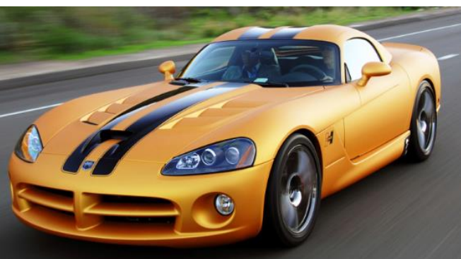
2009 HURST PERFORMANCE VIPER