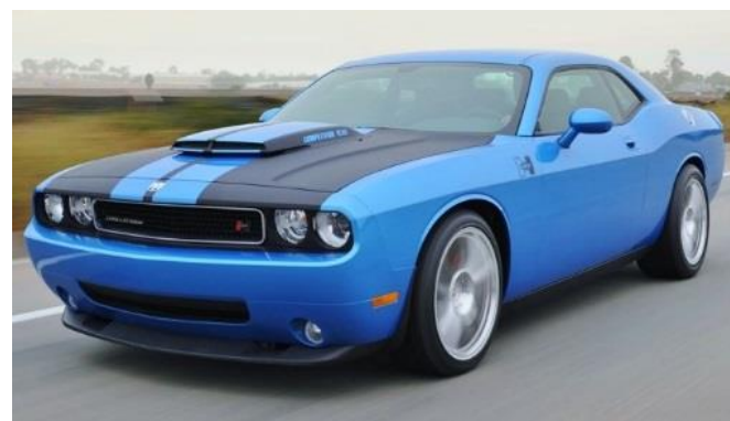
2009 HURST COMPETITION PLUS