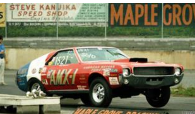
1969 HURST AMX SUPER STOCK