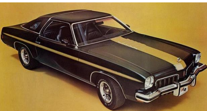
1973 HURST OLDS