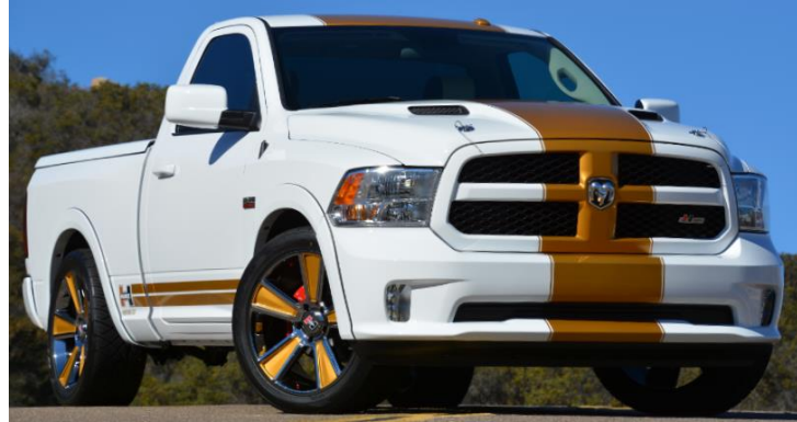
2015 HURST HERITAGE BY GSS RAM