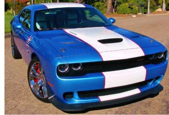
2015 HURST HERITAGE BY GSS HELLCAT