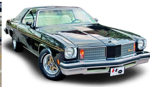
1975 HURST OLDS W30