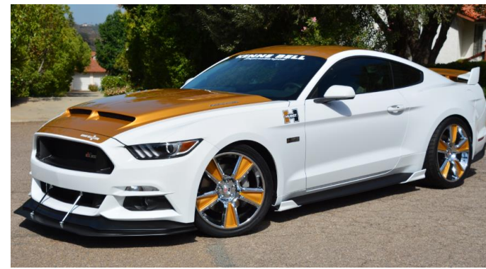
2017 HURST HERITAGE BY GSS MUSTANG