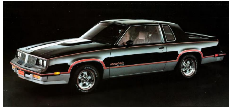
1984 HURST OLDS 442