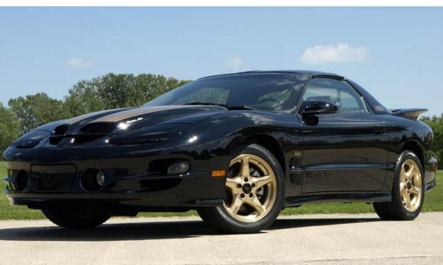
1998 HURST FIREBIRD BY LINGENFELTER