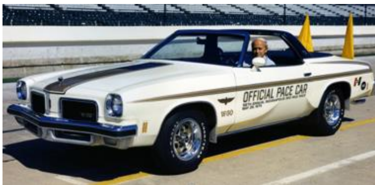
1974 HURST OLDS W30