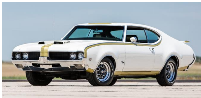
1969 HURST OLDS 442