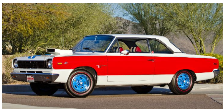
1969 HURST S/C RAMBLER