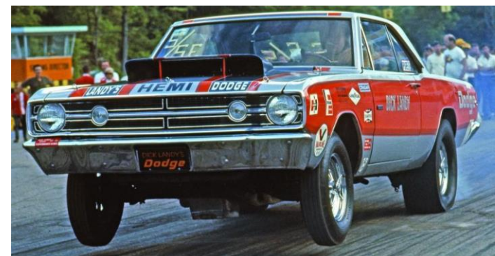
1968 HURST HEMI DART