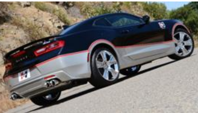
2016 HURST HERITAGE BY GSS RPO CAMARO