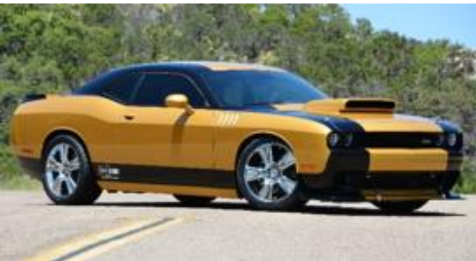
2017 HURST HERITAGE BY GSS HEMI CLASSIC