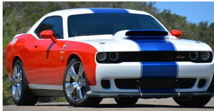
2016 HURST HERITAGE BY GSS PATRIOT