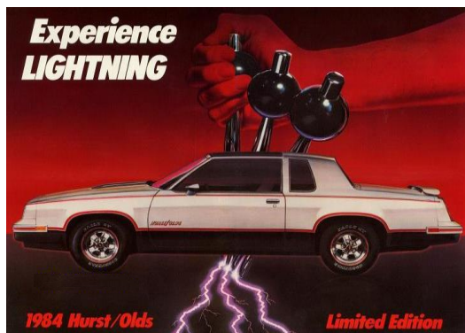
1983 HURST OLDS 442