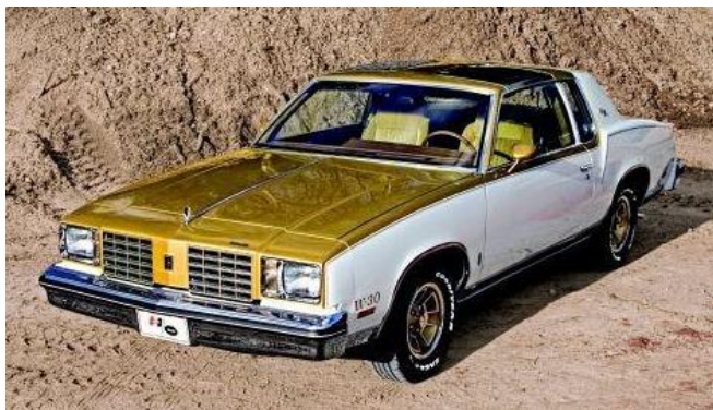
1979 HURST OLDS W-30