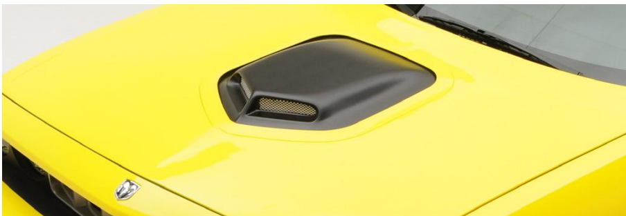
CUDA SHAKER HOOD

The Racers Net for the Mr. Norm's Shaker Hoods is only 845.99 plus shipping. Call GSS SUPERCARS at 760-660-0547 and order your Shaker Hood today!