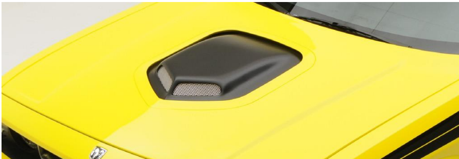
CHALLENGER SHAKER HOOD

The Mr. Norm's Challenger and Cuda Shaker Style Hoods are proudly Made in the USA from only the highest quality American made products. Each hood is hand laid, has rolled edges and features OEM style inner, hinge plates and latching system. The Mr. Norm's GSS Challenger and Cuda Shaker Style Hoods are easy to install using simple hand tools.