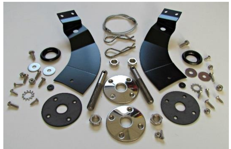
Challenger Functional Hood Pin Kit is standard equipment on the Hurst Heritage GSS Challenger

The Racers Net for the Mr. Norm's Challenger Functional Hood Pin Kit is only $ 179.00 plus shipping. CALL 760-630-0547 AND ORDER YOUR CHALLENGER FUNCTIONAL HOOD PIN KIT TODAY!